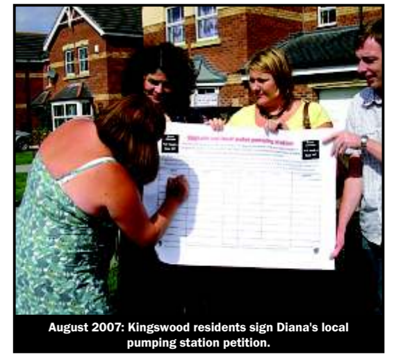
August 2007: Kingswood residents sign Diana's local pumping station petition.

For more information about this petition and how to add your name to it, call my office on 01482 319135 or visit www.dianajohnson.co.uk .