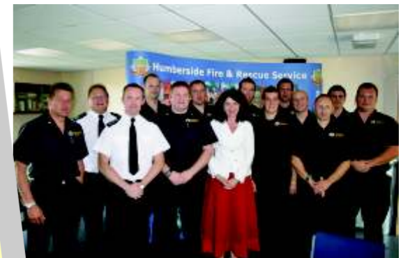
July 2007: Diana met Humberside Fire and Rescue Service to discuss the flooding emergency.